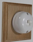
Unfinished Oak .UO