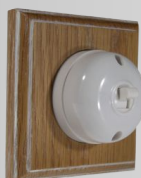
Limed Oak .LO