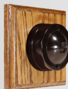
Medium Oak .MO