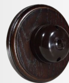
Dark Oak .DO

Can be available as a special order in Ash - Call to order.